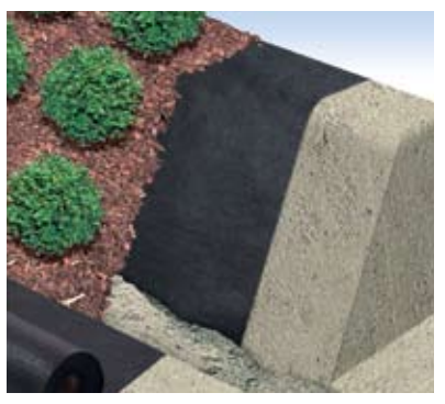
Baffle walls Planted areas by baffle walls and roadside embankments are kept free of root weeds.

Nursery beds, roundabouts, roadsides, roadside embankments and windbreak hedges can be protected against root weeds, and the plants enjoy ideal growing conditions.